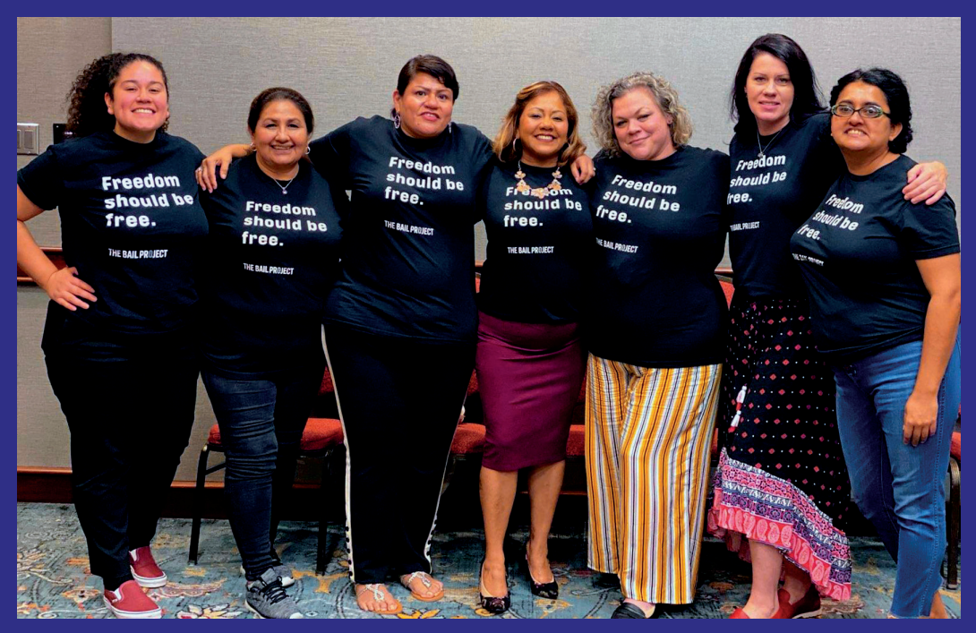
TBP Staff at the #FreeHer conference in Montgomery, AL, hosted by the National Council for Incarcerated and Formerly Incarcerated Women and Girls (NCIFIWG).